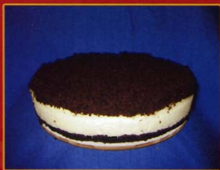
D. COOKIES 'N CREAM