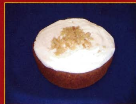
CC. CARROT CAKE