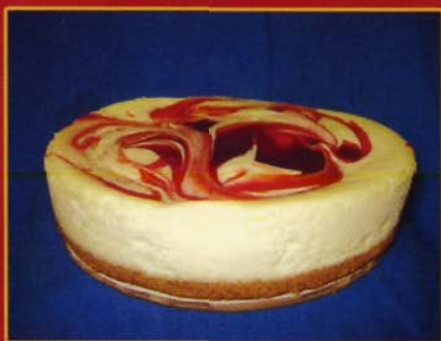
B. RASPBERRY SWIRL