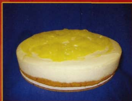
S. LEMON DROP