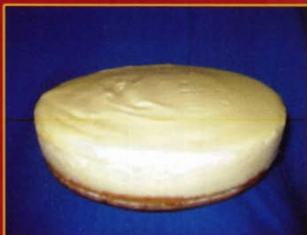
A. SWEETZ CLASSIC